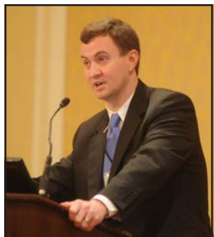
Photo Highlights from the 2011 Annual Meeting