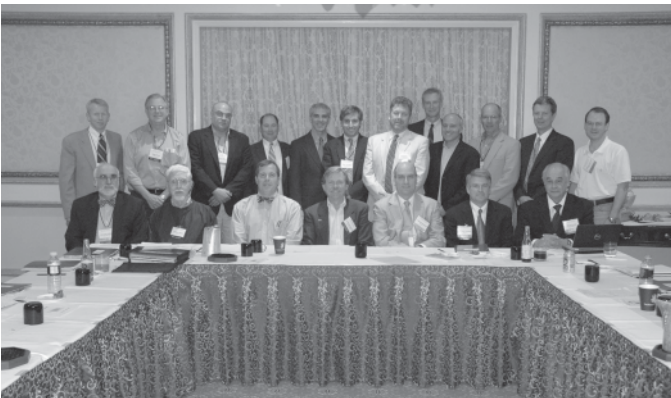
2007-2008 SAVS Council