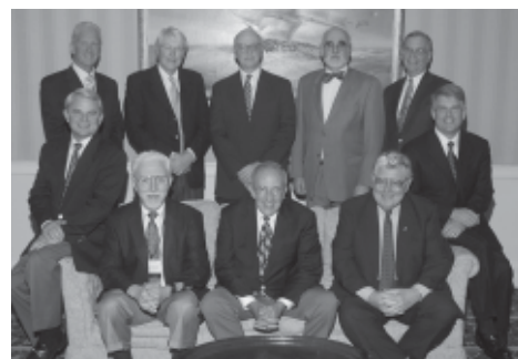
Past SAVS Presidents