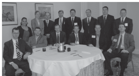
Mock Oral Board Examinees