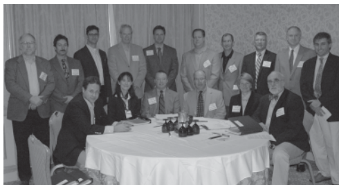
Mock Oral Board Examiners

East Carolina University Greenville, North Carolina Cost per Day of Patency: Understanding the Impact of Patency and Reintervention in a Sustainable Model of Healthcare