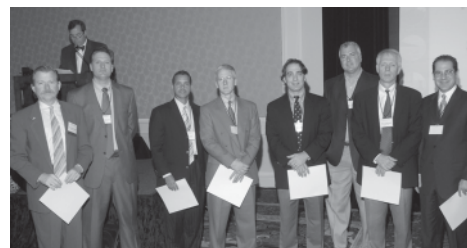
Some of the 2007 New Members